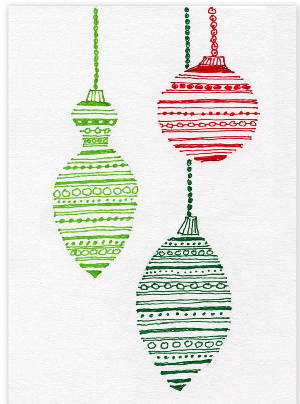
4. Erase all the pencil lines.