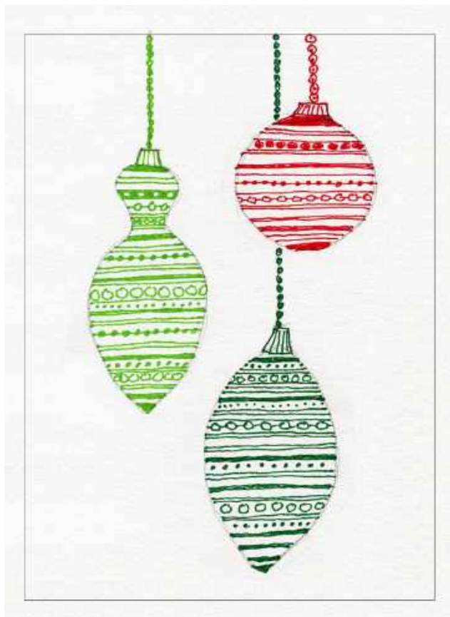
3. Fill in the shapes with lines of patterns.