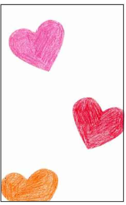
2. Choose about 6 or 7 colors for your color palette, and color the inside of the hearts.