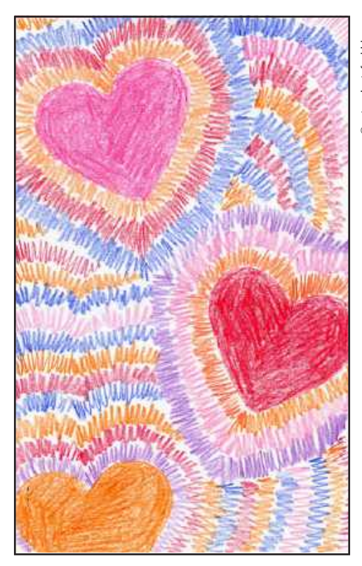
6. When the rings start to touch, switch the pattern to making one large set of rings in the background. Continue until full.