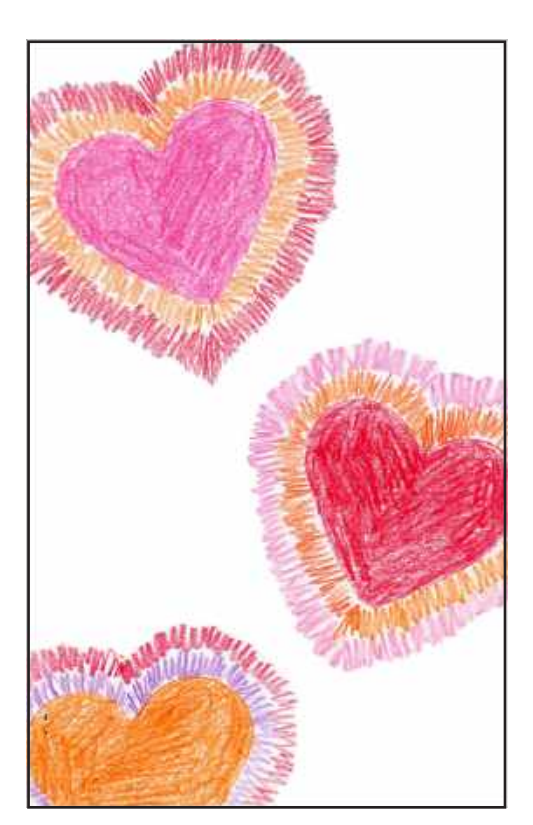
4. Rotate colors and complete a second ring around each heart.