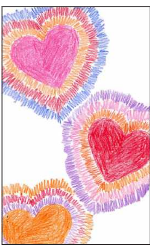
5. Rotate colors and complete a third ring around each heart.